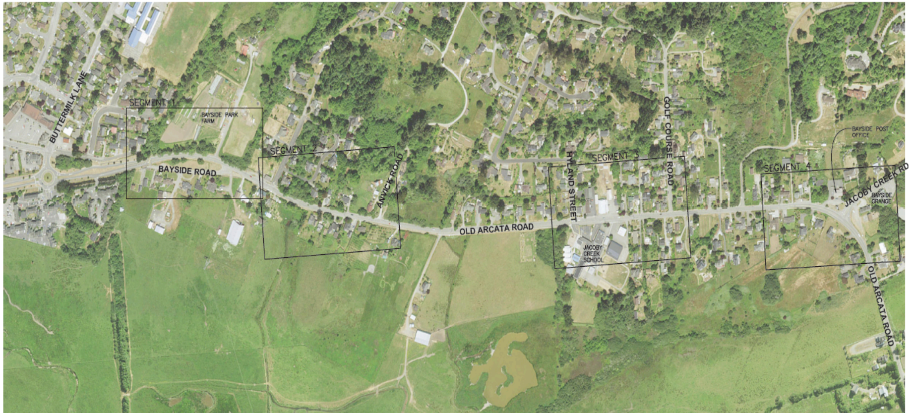
OLD ARCATA ROAD PROJECT AREA - OVERALL SITE

From left to right, Segment 1 – 4 are shown within black rectangles.