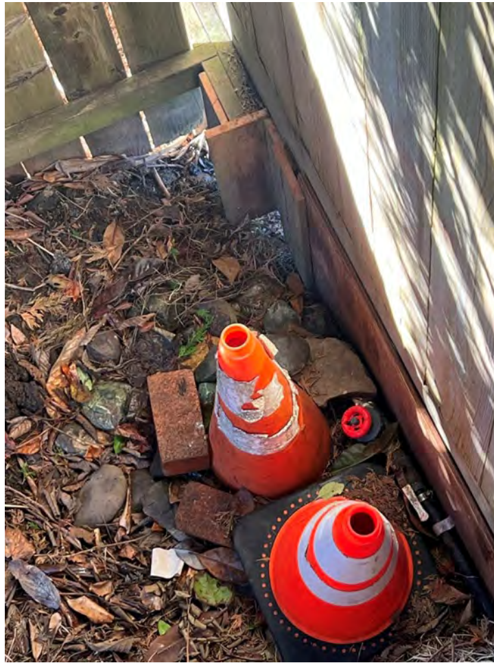
Photo 27. Irrigation system immediately adjacent to location of water source on project site, provided by the client.