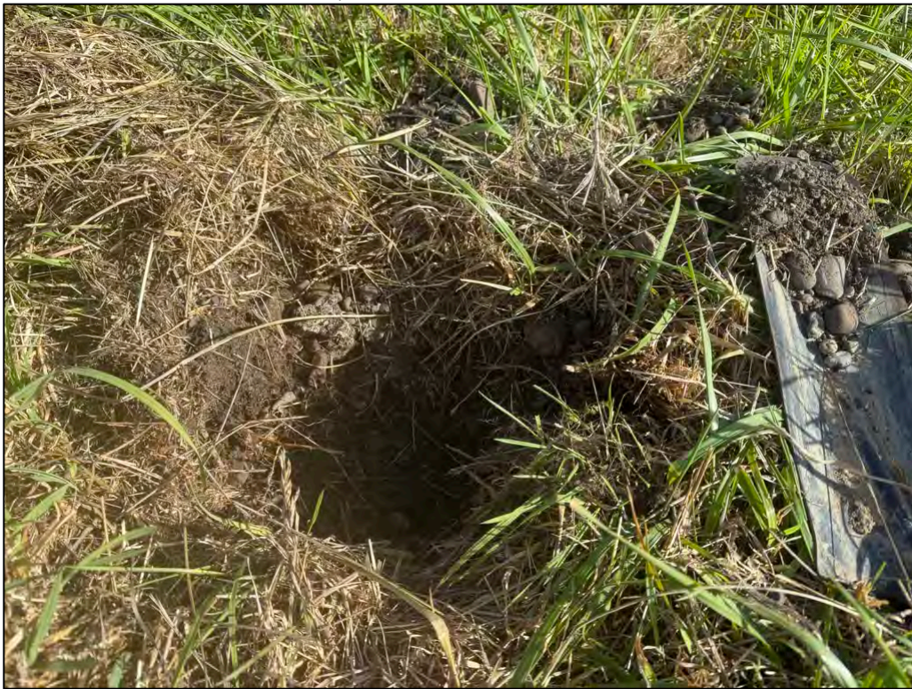
Photo 4. Wetland delineation point 01 (upland point) | October 15, 2024