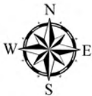
Figure 1 Regional Vicinity Map Roger's Garage Humboldt County, California