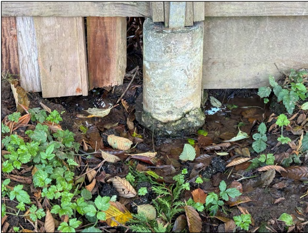
Photo 11. Water source coming from across the fence, facing south. Near wetland delineation point 04 | October 15, 2024