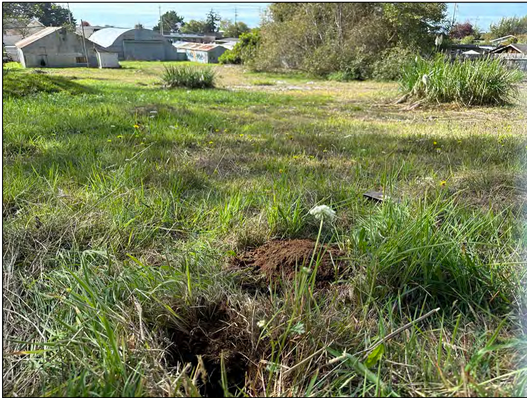
Photo 15. Wetland delineation point 06, facing northwest (upland point) | October 15, 2024