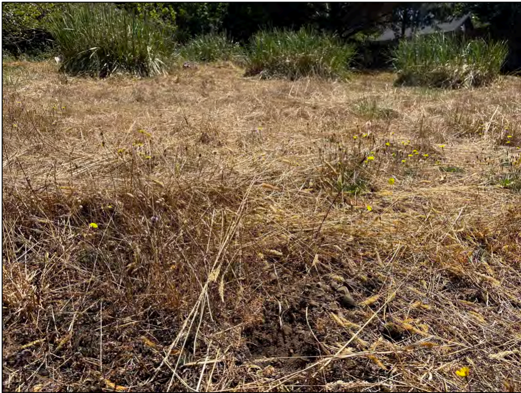
Photo 23. Wetland delineation point 12 (upland) facing southeast, soil pit consists of hardpack at two inches |August 4, 2025