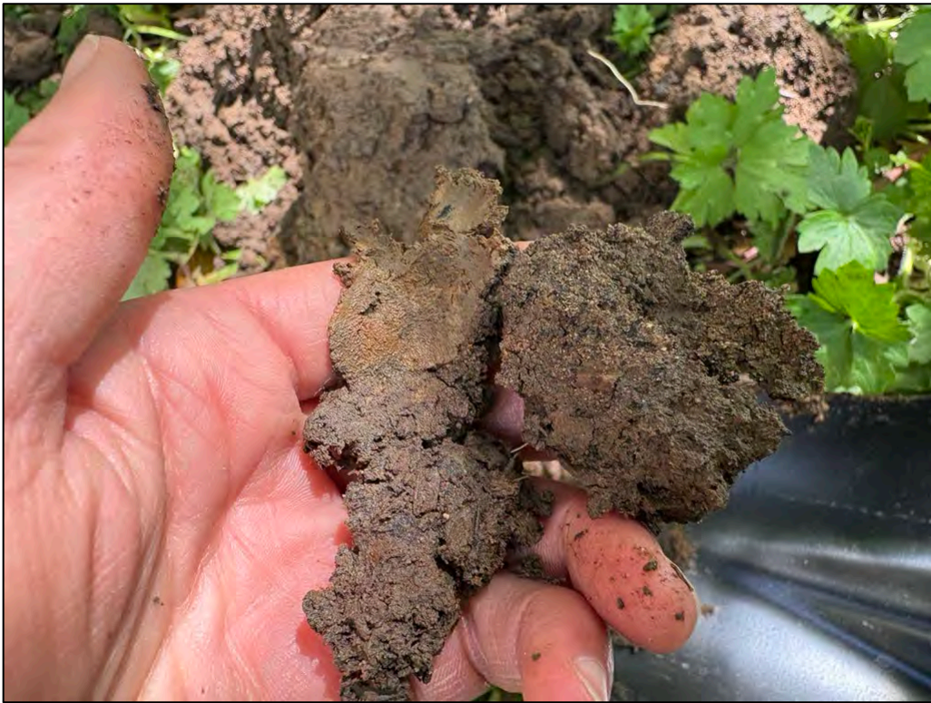
Photo 10. Close-up of soil in point 04 showing saturation present | August 4, 2025