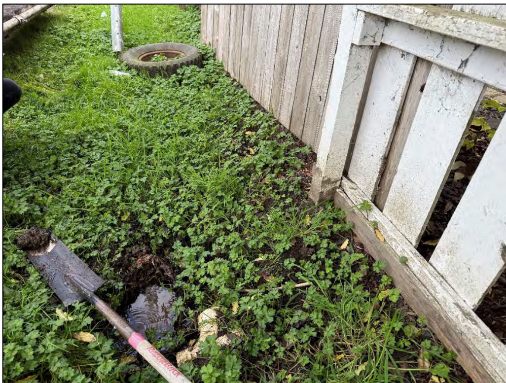
Photo 19. Wetland delineation point 10, facing east (wetland point) | October 15, 2024