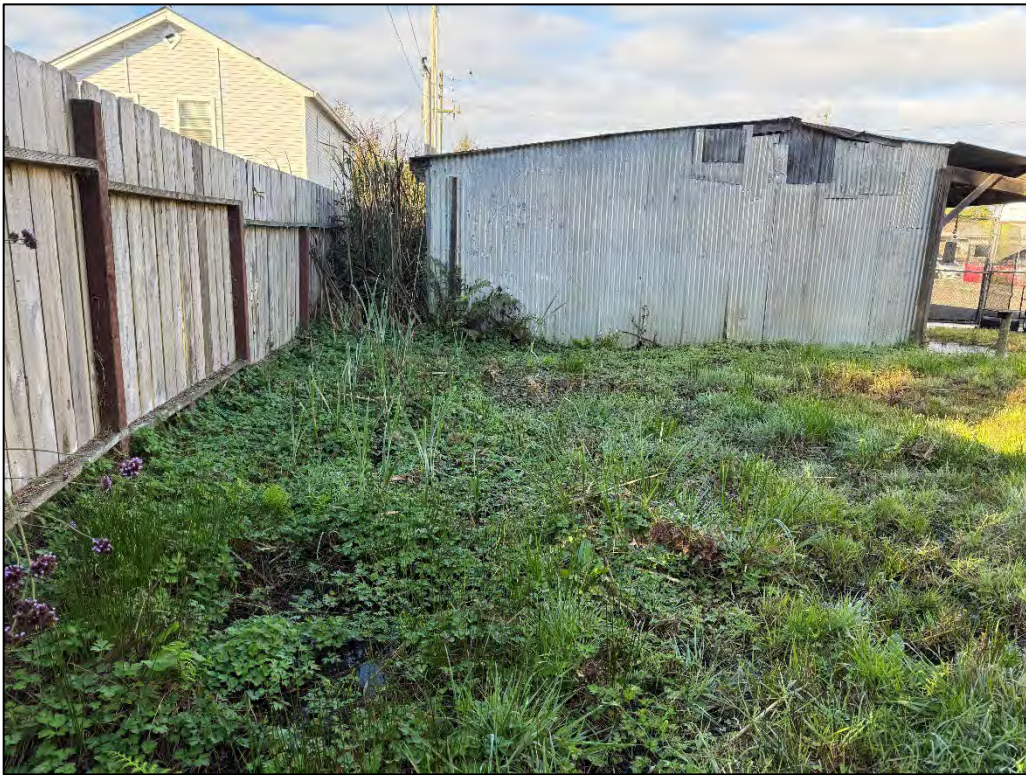
Photo 21. Water pooling in low laying area and continuing flow along fence, facing west | October 15, 2024