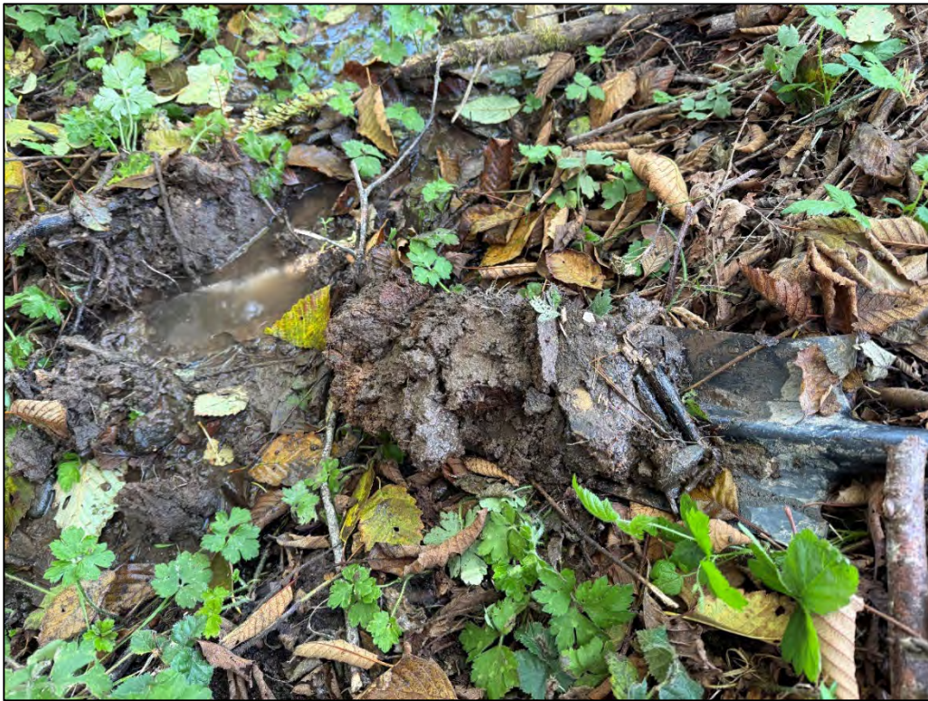
Photo 7. Wetland Delineation point 04 (wetland point) | October 15, 2024