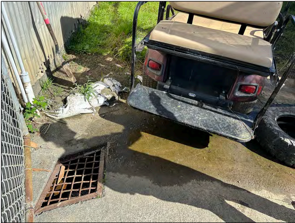
Photo 1. Drain 1, water draining into municipal drain at the locked gate leading into open green space behind buildings | October 15, 2024