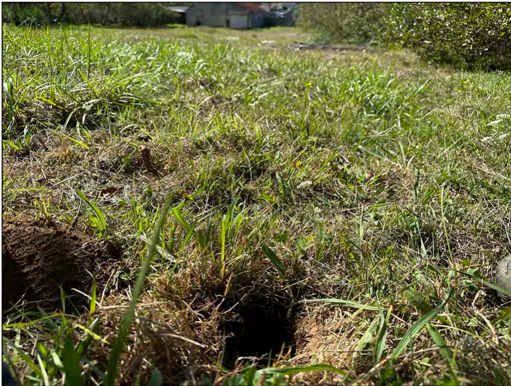
Photo 14. Wetland delineation point 5, facing west (upland point) | October 15, 2024