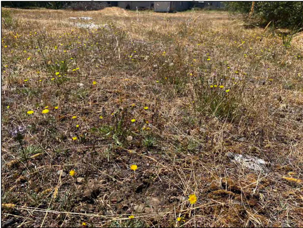
Photo 24. Wetland delineation point 13 (upland) facing southwest, soil pit consists of hardpack at two inches |August 4, 2025