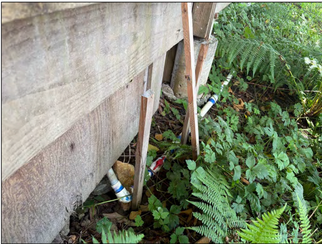
Photo 12. Water source coming from across the fence through a pipe that was not present during initial surveys | August 4, 2025