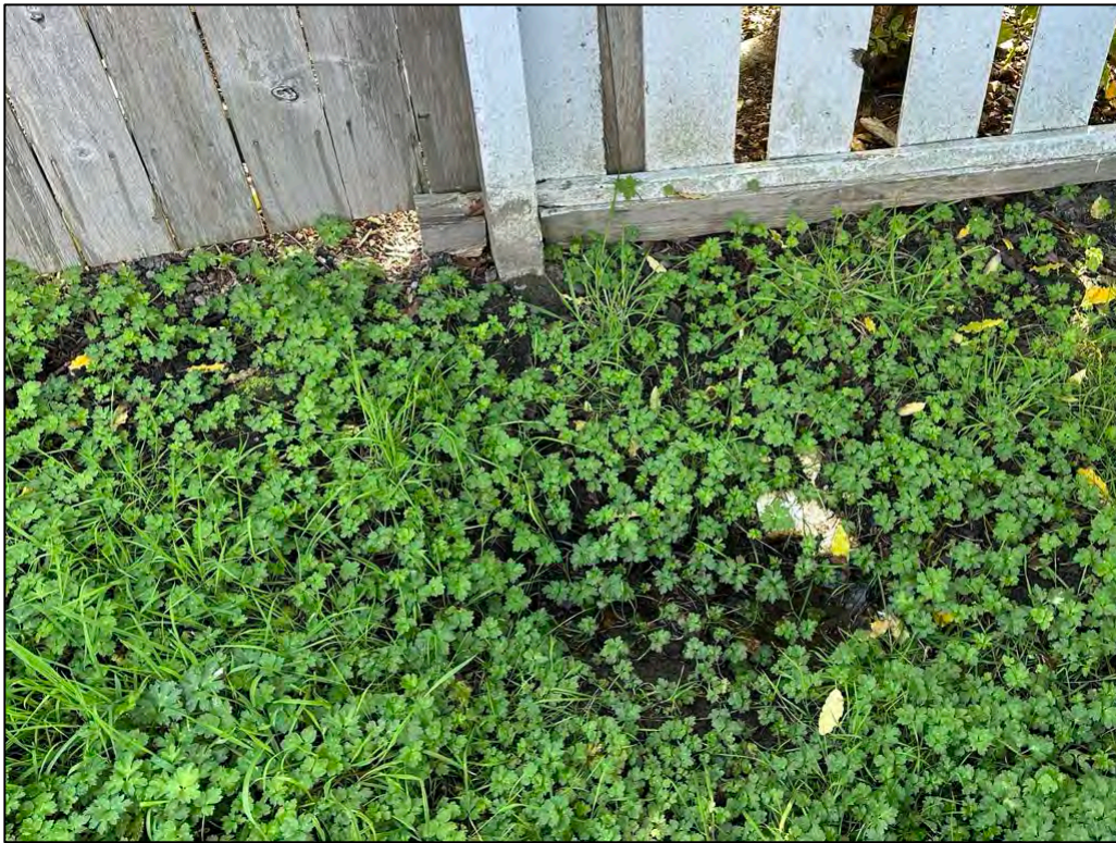
Photo 3. Drain 2, water draining into pipe that is leading into the ground near Old Arcata Rd | October 15, 2024