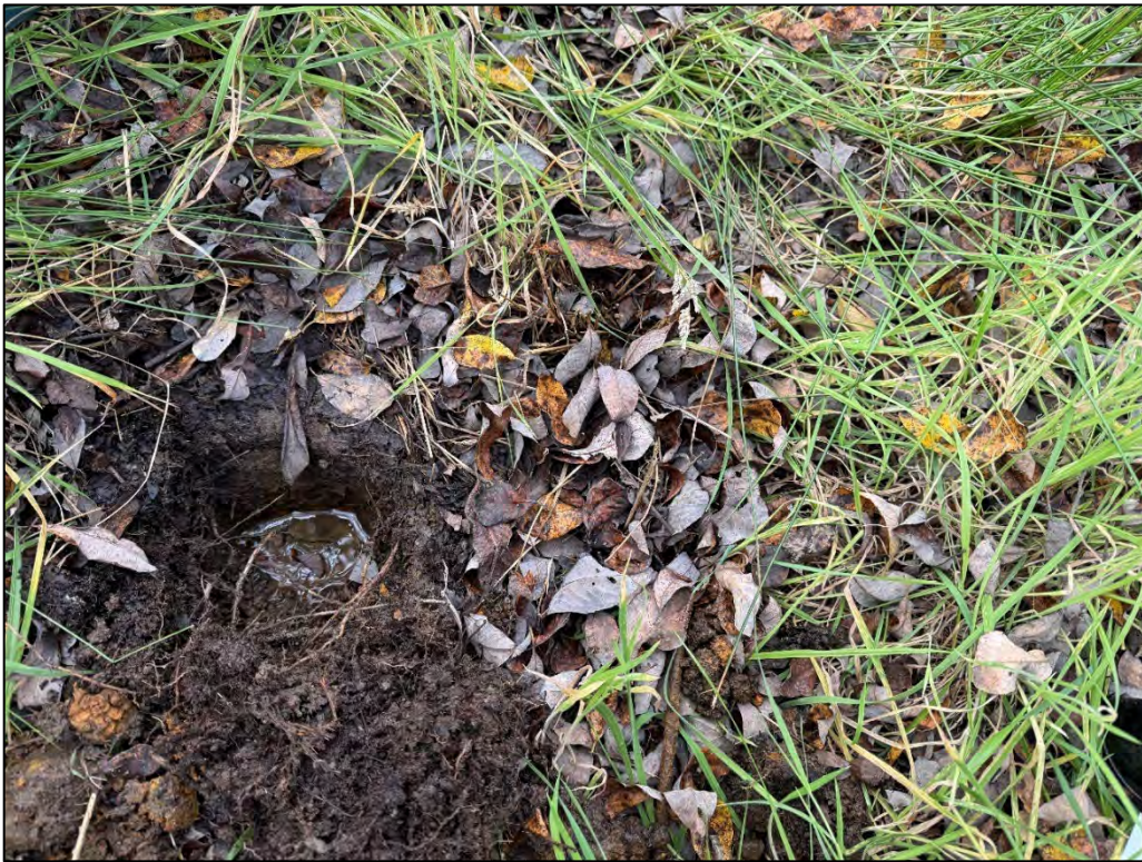
Photo 17. Wetland delineation point 08 (wetland point) | October 15, 2024