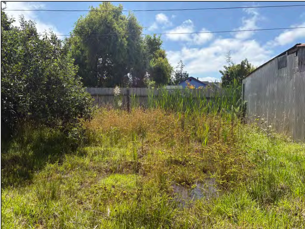
Photo 22. Water pooling in a low-lying area with cattail (OBL), tall flatsedge (FACW) common velvet (FAC) grass, fringed willowherb (FACW), and California golden eye grass (FACW)| August 4, 2025