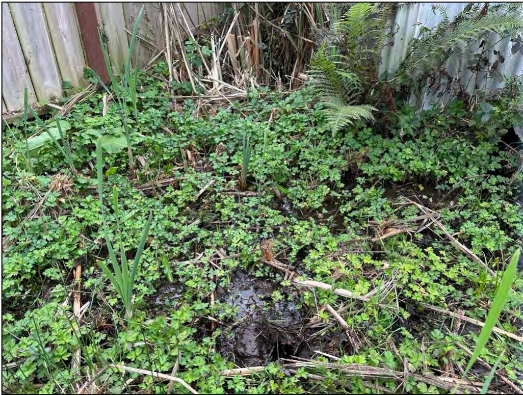
Photo 18. Wetland delineation point 09, facing southwest (wetland point) | October 15, 2024