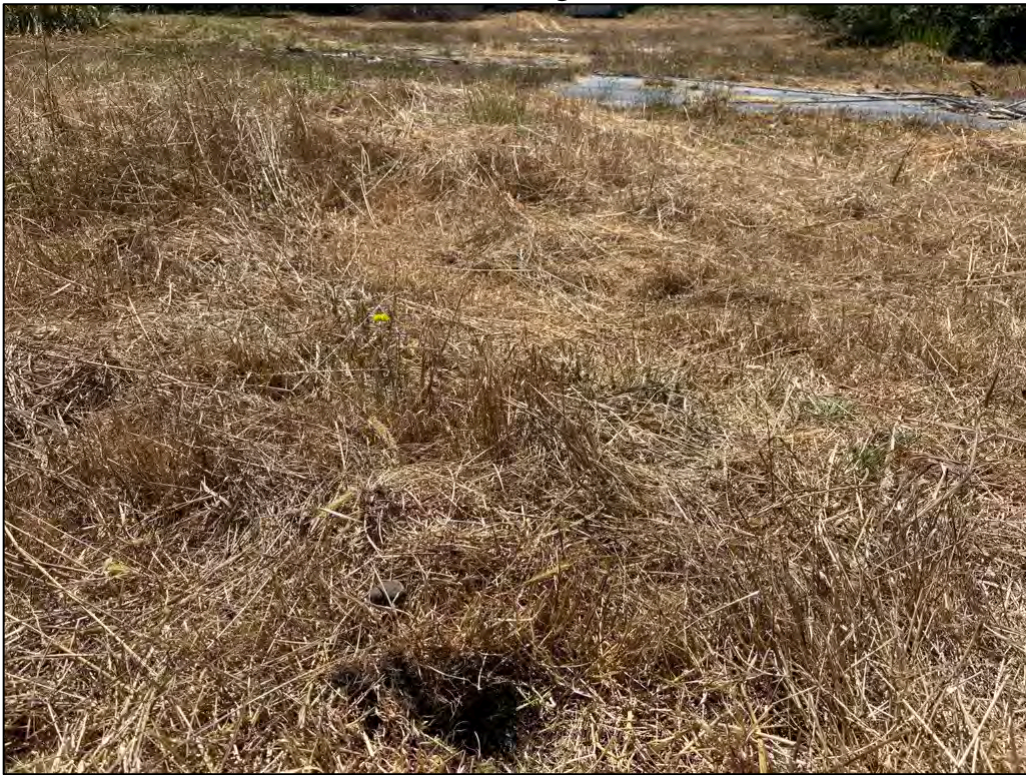
Photo 26. Wetland delineation point 15 (upland) facing southwest, soil pit consists of hardpack at two inches |August 4, 2025