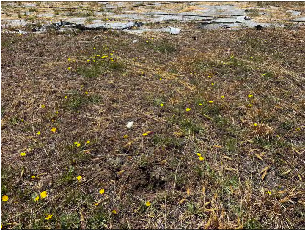
Photo 25. Wetland delineation point 14(upland) facing west, soil pit consists of hard pack at two inches |August 4, 2025