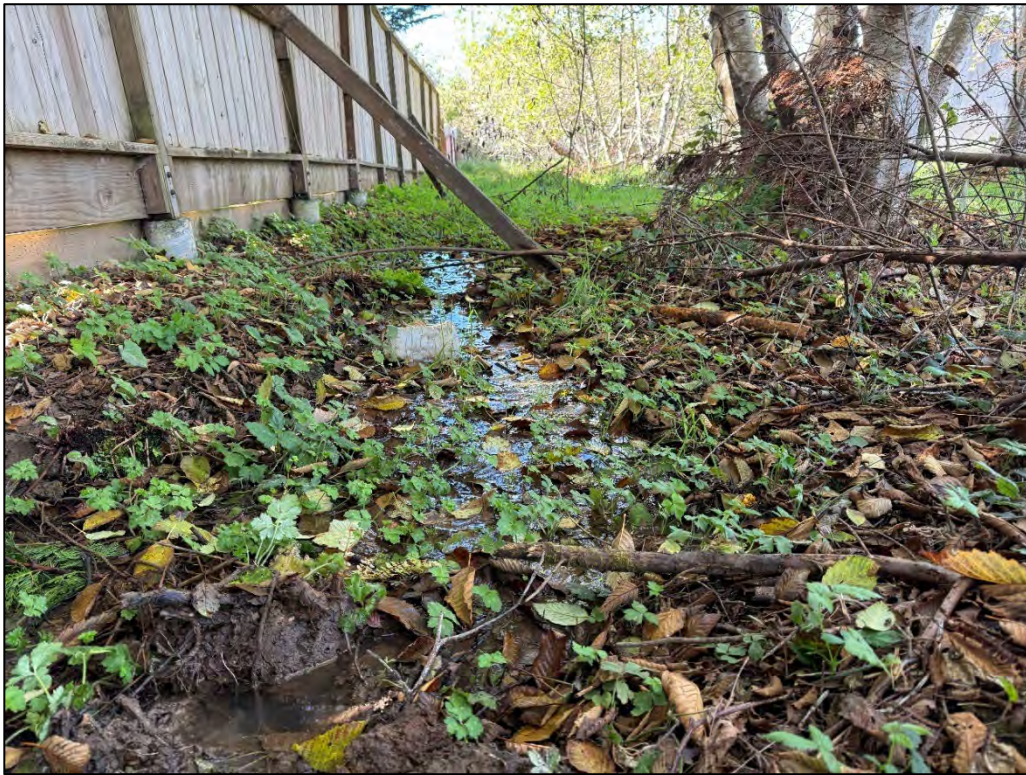
Photo 8. Wetland delineation point 04, facing west (wetland point) | October 15, 2024