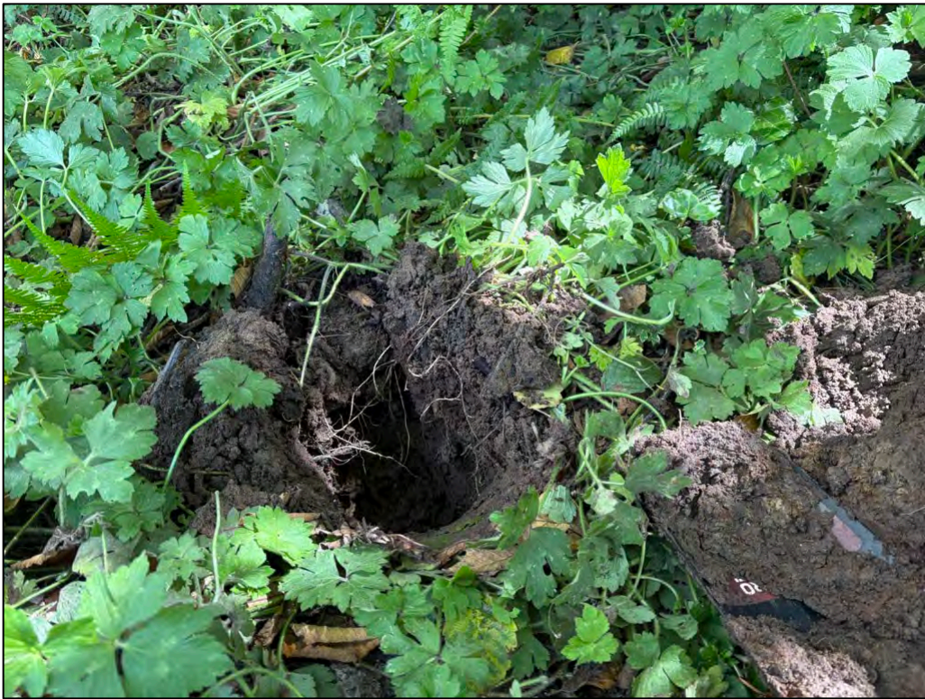
Photo 9. Wetland delineation point 04, lacking surface water | August 4, 2025