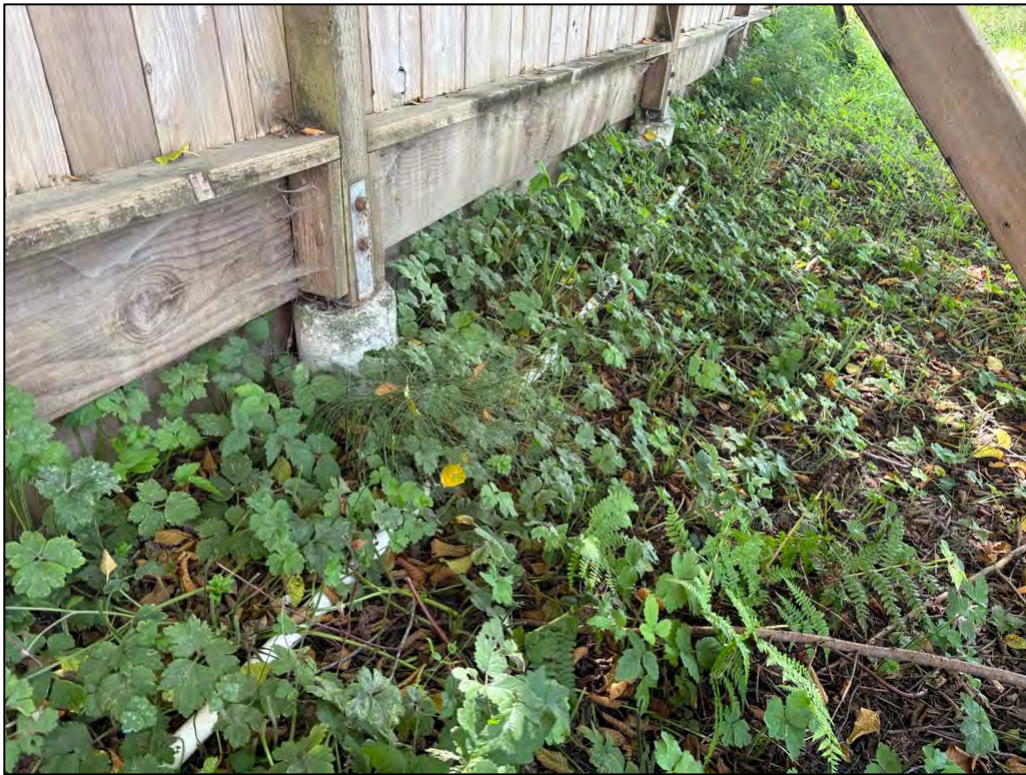
Photo 13. Pipe running along southern border of parcel | August 4, 2025