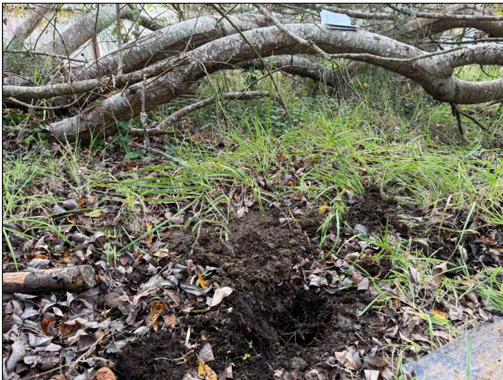
Photo 16. Wetland delineation point 07, facing southwest (upland point) | October 15, 2024