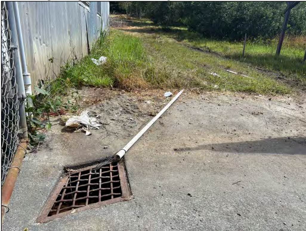
Photo 2. Drain 1 with pipe originating from water source | August 4, 2025