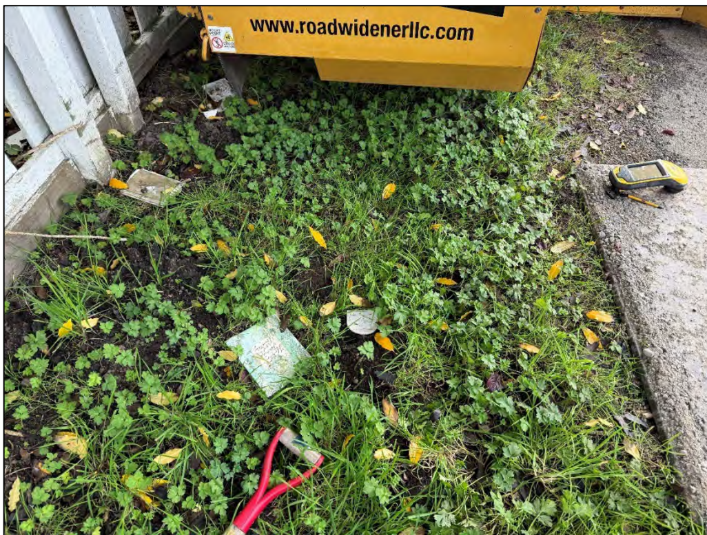
Photo 20. Wetland delineation point 11 (upland point) | October 15, 2024