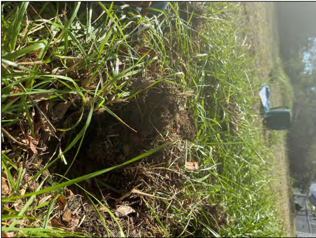
Photo 5. Wetland delineation point 02 (upland point) | October 15, 2024