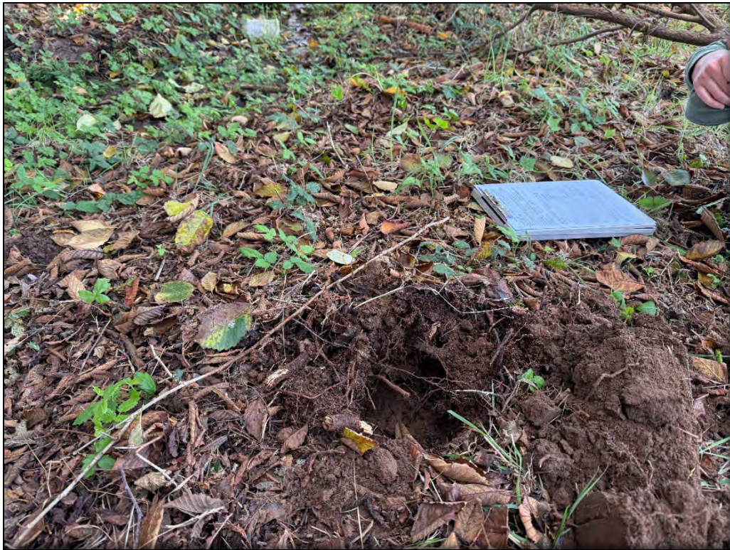
Photo 6. Wetland delineation point 03 (upland point) | October 15, 2024