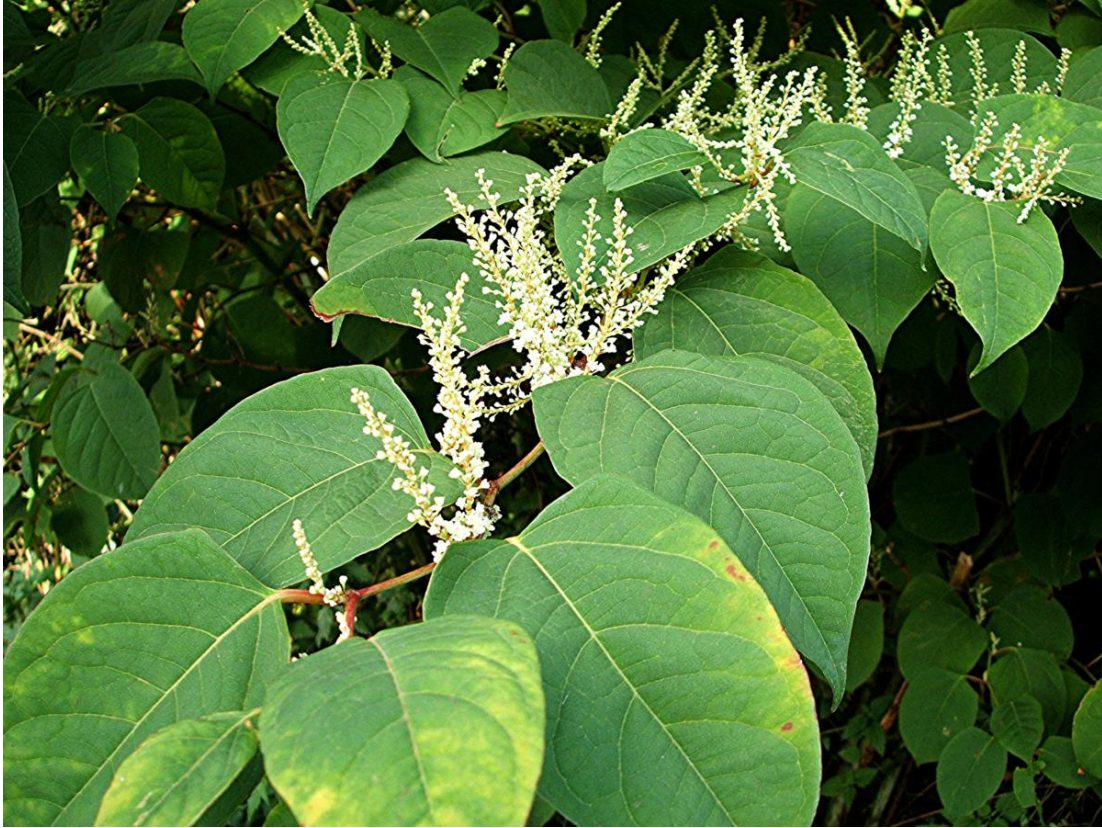
Himalayan Knotweed ( Persicaria wallichii )