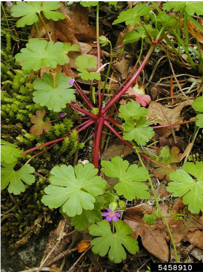
Shiny Geranium ( Geranium lucidum )