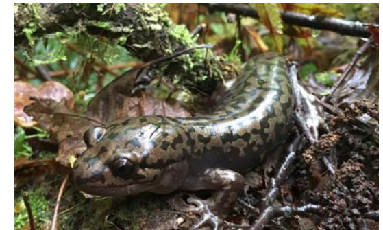
Pacific Giant Salamander

By ensuring that carbon from these trees will remain sequestered within the Community Forest in perpetuity, the City of Arcata is showing how sustainable forest management can be part of the climate adaptation solution.