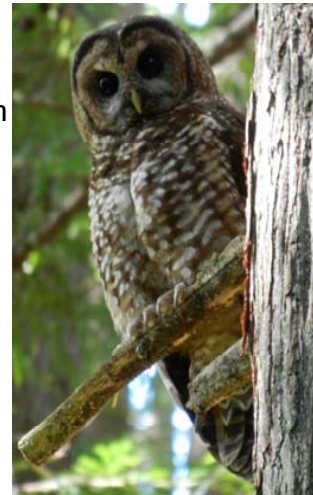
Northern Spotted Owl

Carbon offsets are certificates that represent a reduction of greenhouse gases in the atmosphere. Projects that prevent the release of greenhouse gases earn these credits, which can then in turn be sold to other businesses and individuals to voluntarily offset the emissions they generate. One carbon offset is equivalent to reducing one metric tonne of carbon dioxide emissions (CO 2 ).