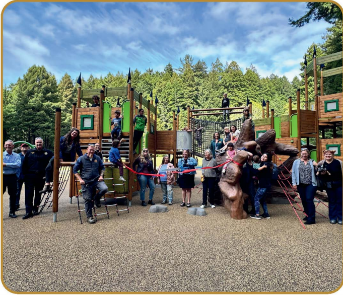
Newly Renovated Redwood Park Play Area