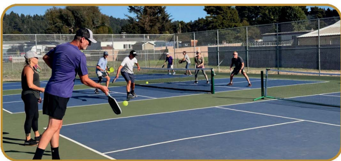
Just Opened Carlson Park Pickleball Courts

Sales Tax is paid by anyone who makes taxable purchases in Arcata. This includes local governmental agencies like Cal Poly Humboldt. It is estimated that less than 60% of current sales tax revenues are paid by Arcata residents. The City estimates the tax will generate $2.6 million per year.