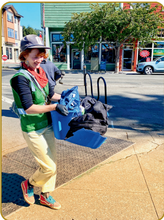
Community Ambassador Cleans the Plaza