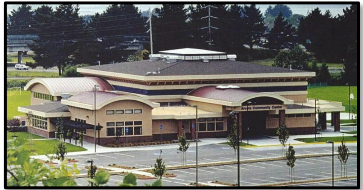
Arcata Community Center Use - Table G

See Table G, for a breakdown of the hours used by facility users.