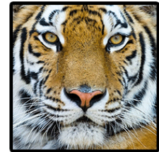
ARCATA HIGH SCHOOL

Objective. Value Arcata's educational institutions and facilities as keys to achieving the high educational standards that will lead to prosperity and community wellbeing. Partner with schools and the University in support of Arcata's future prosperity, and our diverse and tolerant cultures. Seek the cooperation of Arcata's educational institutions to achieve City goals. Identify student enrollment increases, based on the projected future population of the City, and coordinate with local school (public and private) districts, and other education providers to maintain and improve educational facilities and services. Coordinate with Cal Poly Humboldt to project demand for City services and facilities based on anticipated increases in enrollment and employment. .