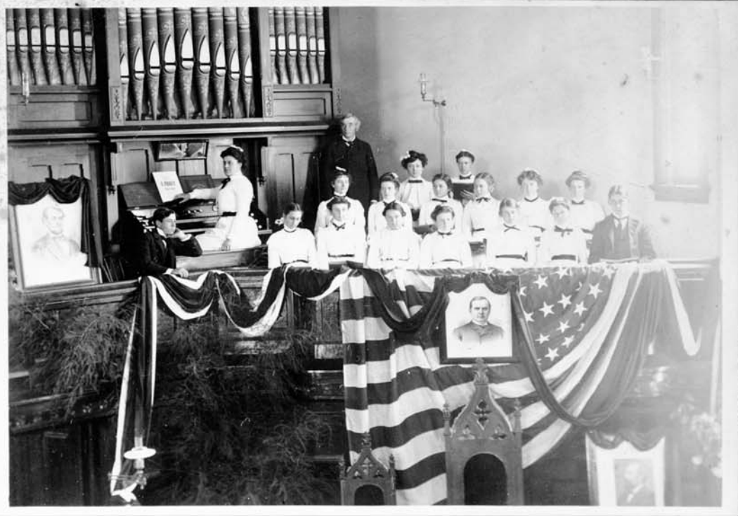
A memorial service for President McKinley was held at the Congregational Church in Eureka on Sept. 19th, 1901.